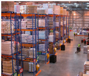
Warehouses & Distribution Centers