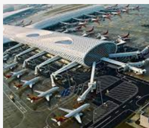
Airports & Transportation Hubs