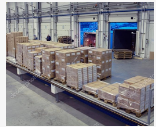
Any Business with a Loading Dock