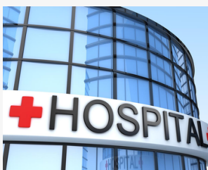
Hospitals & Healthcare Facilities