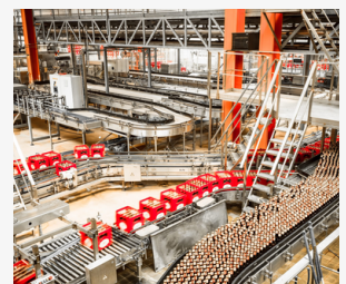
Food & Beverage Industry