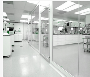
Cleanrooms & Laboratories